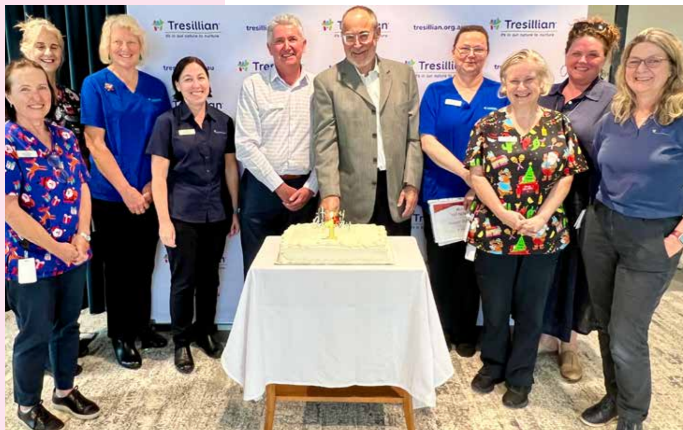
ABOVE: On the 28th November, 2024 we celebrated the one-year anniversary of the newly transformed Tresillian Wollstonecraft, recognising the remarkable accomplishments achieved in our inaugural year of operation.

Parenting Services”, which aligns with Tresillian’s Strategic goal of delivering on father-inclusive practice.